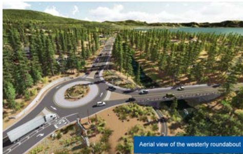
Aerial view of the westerly roundabout

THE SR 89/ FANNY BRIDGE PROJECT - Work is underway on the SR 89/Fanny Bridge Community Revitalization Project in Tahoe City to build a new Truckee River bridge east of the Caltrans Maintenance Yard, to realign existing SR 89 with roundabouts on either end, and replace the existing Truckee River (Fanny) Bridge. For more information and road/project updates, please visit www.FannyBridge.org .